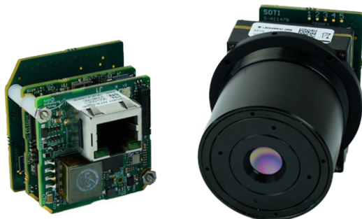
Viento HD10 GigE