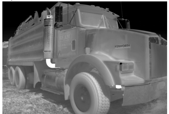
Close Up Dump Truck