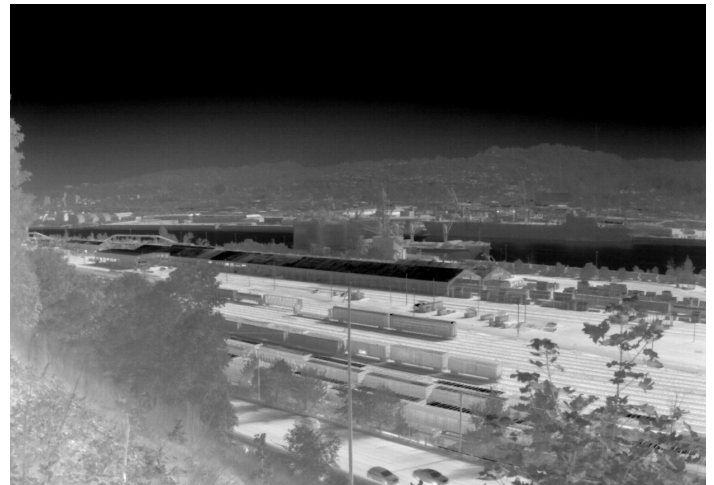
Railyard from cliffside